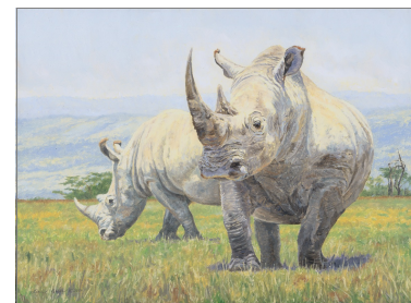
Defiant 11" X 15" $2200.