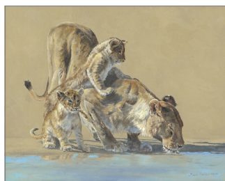
Jungle Gym 8.5" X 10.5" $1600.