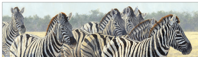
Waiting For the Lion to Leave 13" X 47" $7000.