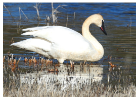
March 2025

One of my favorite spots to visit when springs first arrives is Turnbull Wildlife Refuge just outside Cheney, WA. It's only an hour from my house. Once again Turnbull did not disappoint. We've had a wet March so the ponds were full and one gathering spot had 13 trumpeter swans. As an added bonus some pintails had arrived to keep them company. If that was all we saw it would have been enough, but there was more. Songbirds had started to arrive and a young moose from last year was snacking on the first buds of spring.