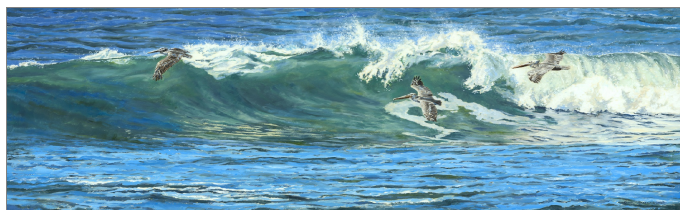
Surf's Up 12" X 30" $4200.