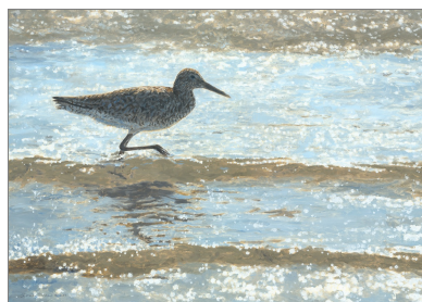
Walkin' On Sunshine 14" X 20" $3100.