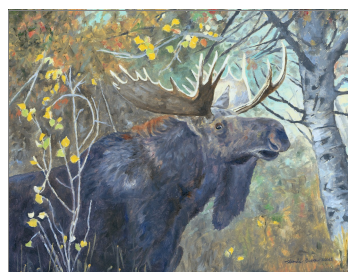
Casanova 9" X 12" $1700.