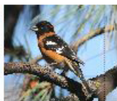
Black-headed grosbeak

He proceeded to demonstrate how very flimsy heavy gauge metal mesh can be!