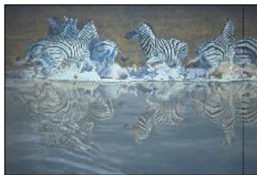
Spooked 24" X 36" $8500.