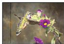
Summer Jewels (M-F calliope)