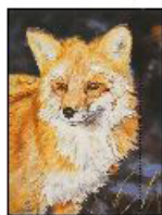
Little Red 8" X 6" $750.