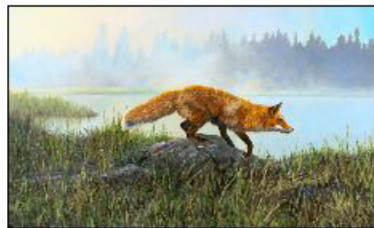
Morning on the Marsh 17" X 28" $4700.