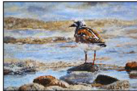
King of the Rock 8" X 12" $1400.