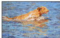
Chessie 8" X 13" $1300.