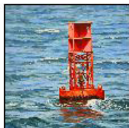
Bell Ringer #2 9" X 9" $1200.