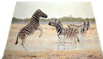
Challenger 20" X 36" $6000. The painting is a trapezoid