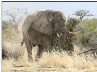
Tusker 15" X 20" $3400.