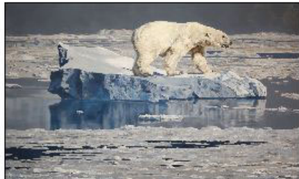
Ice Bear 22" X 36" $9000.