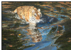
Stalk - Amur Tiger 24" X 34" $8700.