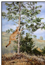
Amur 18" X 24" $5750.