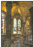
One Candle 20" X 14" $3200.